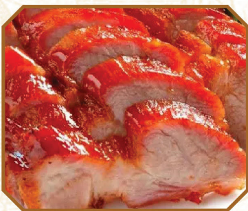
Honey BBQ Pork