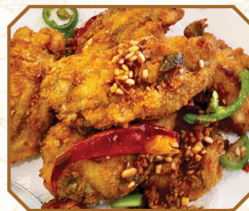
Baked Oyster w/ XO Chili Sauce