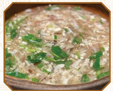
West Lake Beef Soup