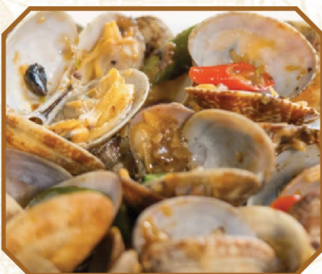
Clams w/ Black Bean Sauce