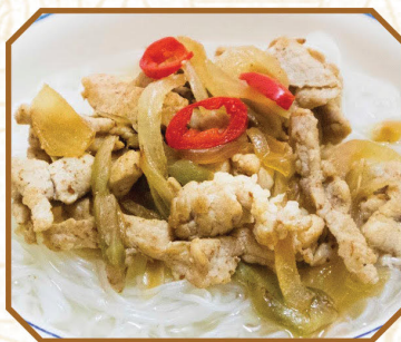
Shredded Pork w/ Preserved Veg. Rice Noodle Soup