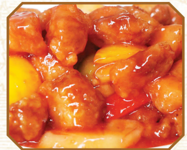
Sweet & Sour Pork