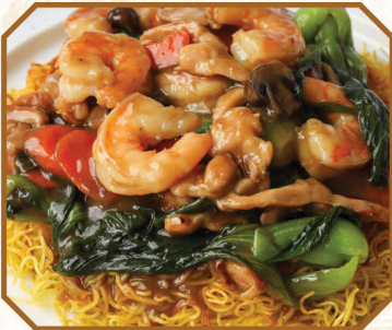
House Special Chow Mein*