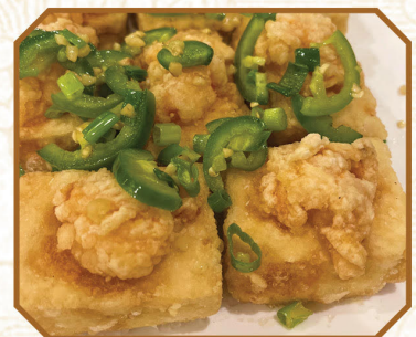
Fried Tofu & Minced Shrimp w/ Salt & Pepper