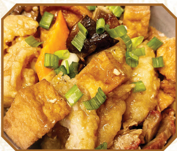
Braised Cod Clay Pot