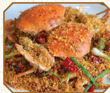
Deep Fried Crab w/ w/ Chili Pepper