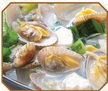
Clams & Tender Greens in Supreme Broth