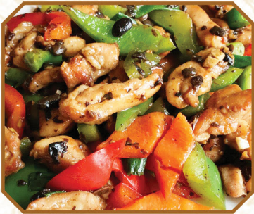
Chicken w/ Black Bean Sauce