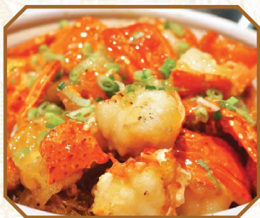
Sizzling Lobster w/ Vermicelli Clay Pot