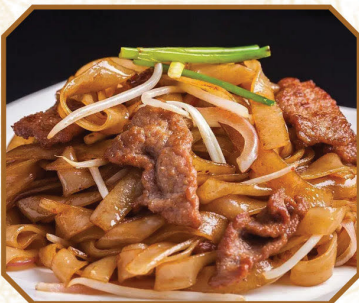
Beef Chow Fun