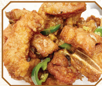
Spareribs w/ Salt & Pepper