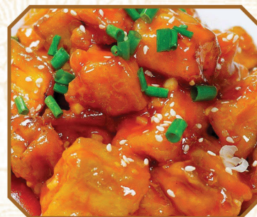
Fried Tofu w/ Sweet & Sour Sauce