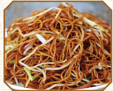
Supreme Soy Sauce Chow Mein