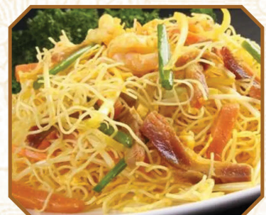
Singapore Fried Rice Noodle