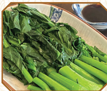
Chinese Broccoli w/ Oyster Sauce