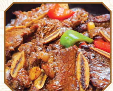
Beef Short Ribs w/ Honey & Pepper Sauce