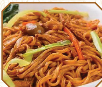
Braised E-Fu Noodle w/ Crab Meat