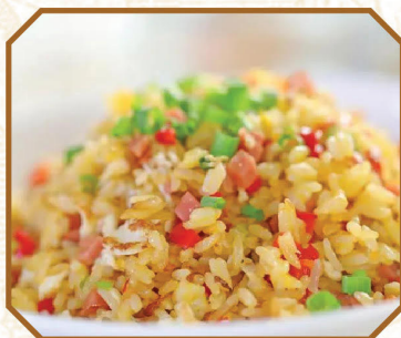
Golden & Silver Egg Fried Rice