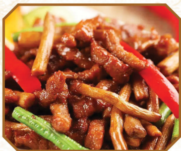
Mushroom Beef w/ BBQ Sauce