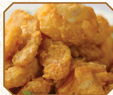
Salted Egg Yolk w/ Shrimp