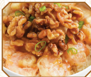
Honey Walnut Shrimp