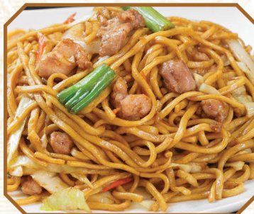
Chicken Chow Mein