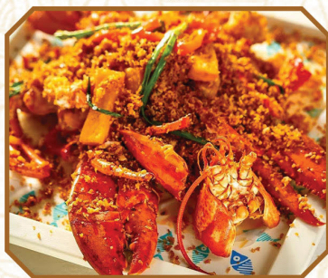
Deep Fried Lobster w/ w/ Chili Pepper