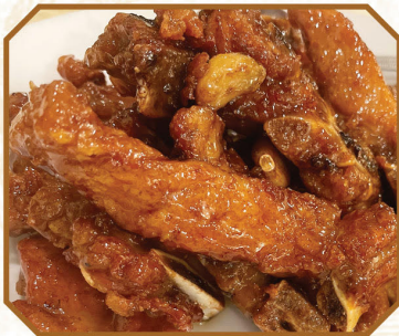
Honey Garlic Spareribs