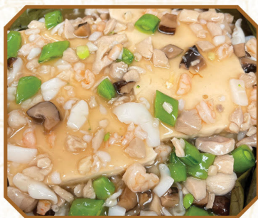
Steamed Tofu w/ Seafood & Chicken